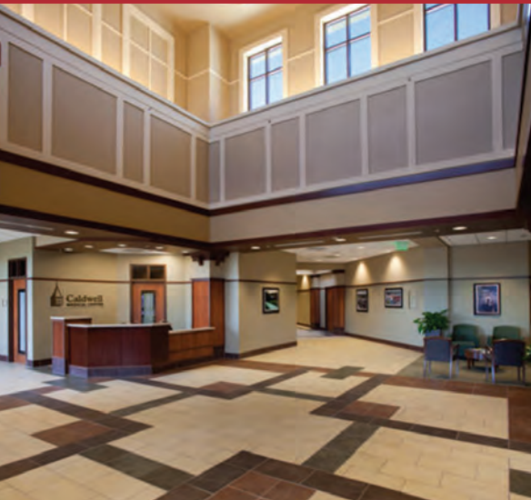
CALDWELL COUNTY HOSPITAL, PRINCETON, KY.