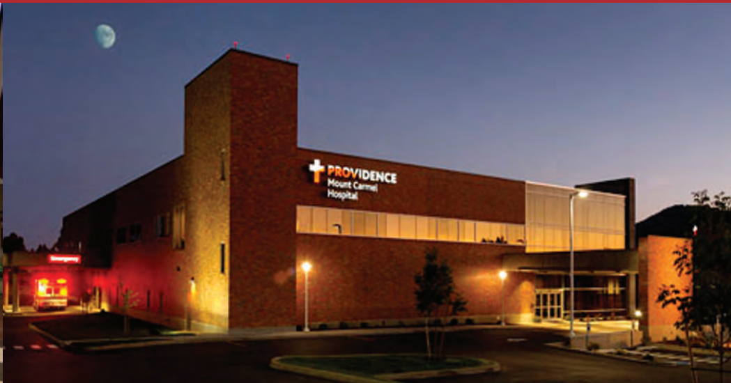
PROVIDENCE MOUNT CARMEL HOSPITAL, COLVILLE, WA.